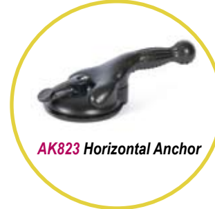
AK823 Horizontal Anchor