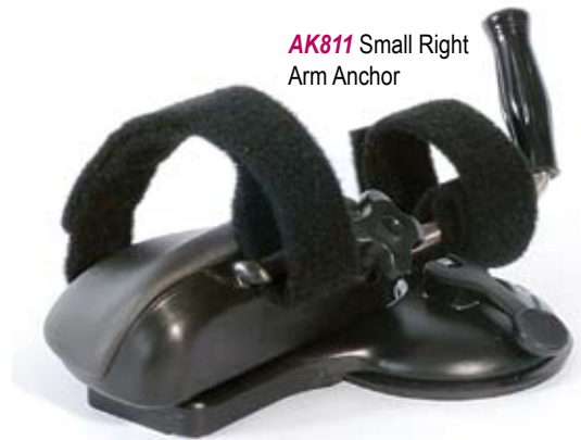
AK811 Small Right Arm Anchor

The industrial-strength 12 cm diameter suction cup comes with a locking lever for easy application and release. The comfortable padded armrest is from the Pacer Gait Trainer and comes with arm and wrist straps. The handhold extends in length and adjusts in angle for forearm rotation.