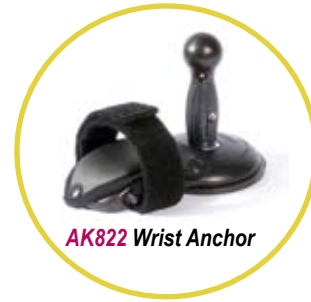
AK822 Wrist Anchor

Attached to a smooth, hard surface (either a table top or floor), the 4.5" diameter industrial strength suction cups will not slip or shift. These anchors include hand anchor, grab bar, wrist anchor, horizontal anchor and elbow anchor to suit individual needs.