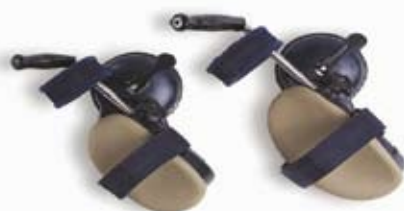
Arm Anchor comes in two sizes.