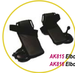
AK815 Elbow Anchor (Right) AK816 Elbow Anchor (Left)