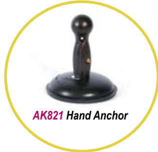
AK821 Hand Anchor