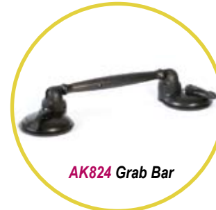
AK824 Grab Bar