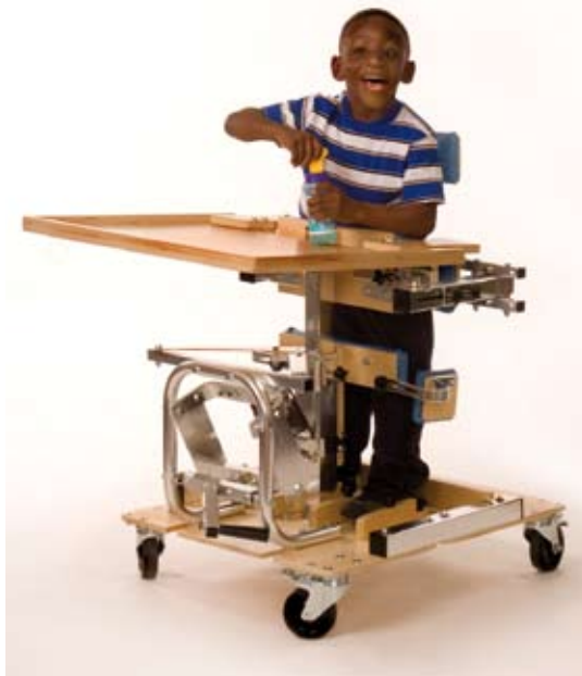
ADS3, Small Kaye Dynamic Stander, shown with tray and Lateral Leg Supports.

Included with the Dynamic Stander is a tray for holding materials and activities. Additional components are Lateral Leg Supports and Leg Abductor.