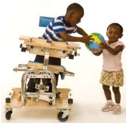
ADS3 small Kaye Dynamic Stander