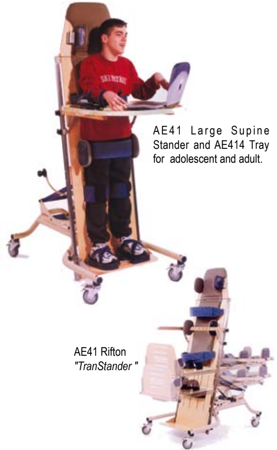
AE41 Large Supine Stander and AE414 Tray for adolescent and adult.