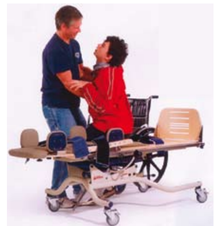
The AE41 large Supine Stander is able to adjust horizontally between 53cm to 76cm. Making it possible to transfer to and from a wheelchair.