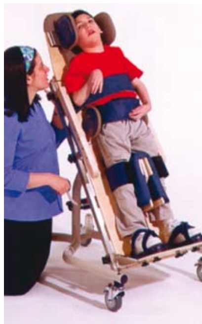
AE40 Small Supine Stander with adjustable abduction wedge. The manual winding mechanism allows for gradual increase of weight bearing and control of angle.