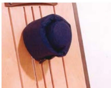
Round Abduction Block AE602 and Collar AE603.