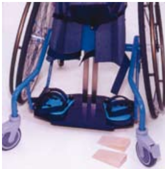
Sandals and Wedges fix the user's feet and ankle to the platform, improving posture and alignment.