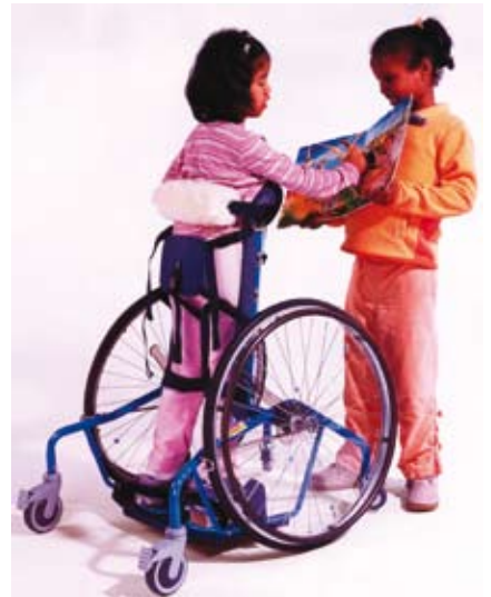
The Dynamic Stander encourages the child to stand upright and to participate in indoor and outdoor activities allowing the user to move around and interact with friends.