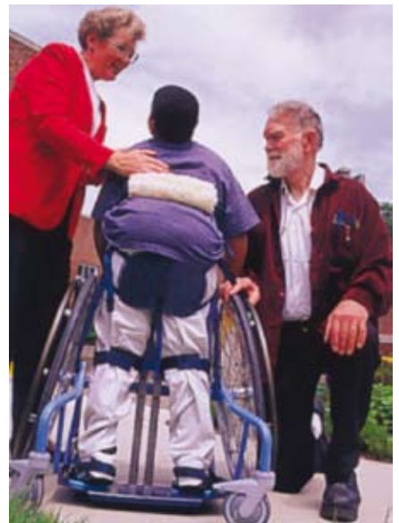
The Dynamic Stander helps by supporting the user to stand and to weight bear.