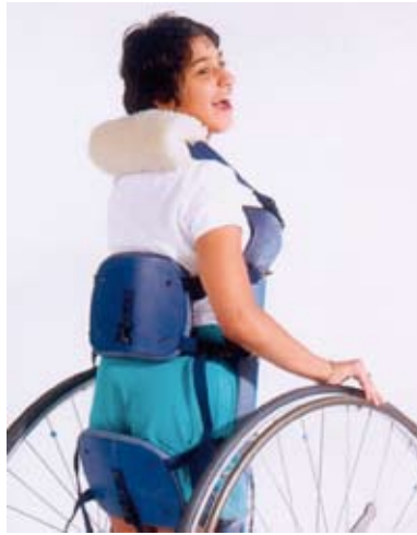
An additional Seat Pad and fleece covered top strap can be added to the stander to help limit a user's neck extension.