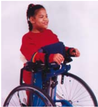
The arm prompts help the user to stabilize arms, improving shoulder and head posture.