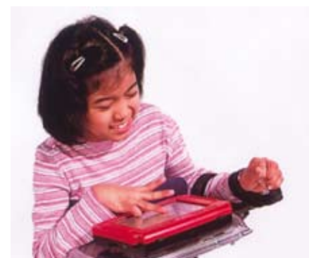
Using an arm prompt to stabilize the upper body, the user is able to effectively operate her communication device.