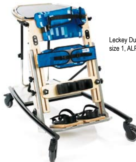
Leckey Dual Stander size 1, ALPS/2.