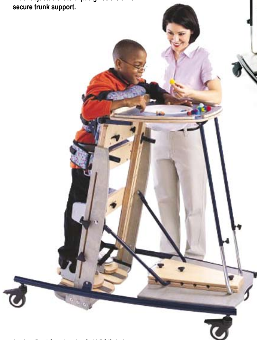
Leckey Dual Stander size 3, ALPS/3, helps children to stand and play.

*Other upholstery colour or vinyl available upon request.