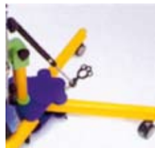
Gas operated tilting system