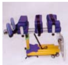
Folds for easy storage and transport