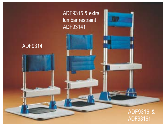
ADF9315 & extra lumbar restraint ADF93141

# Please note that the Activity Tray has been discontinued