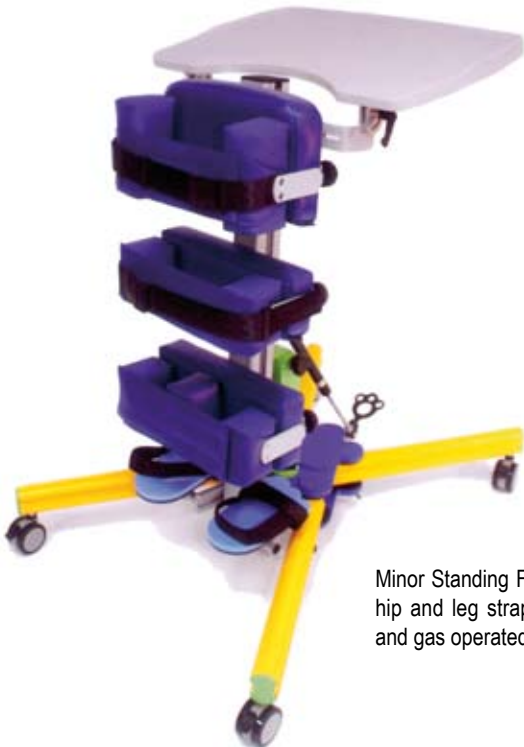
Minor Standing Frame with chest, hip and leg straps, therapy table and gas operated tilting system.