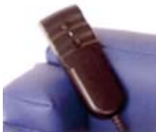
Electric Actuator system