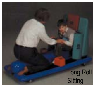
Long Roll Sitting