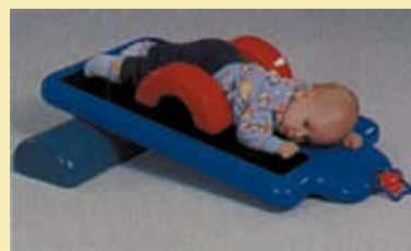
Tadpole allows postural drainage