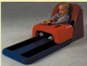
Long leg sitting