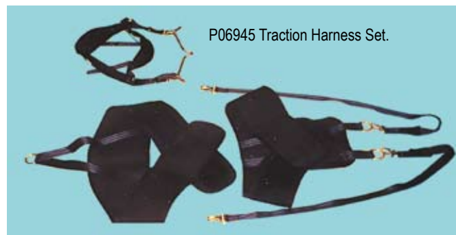
P06945 Traction Harness Set.