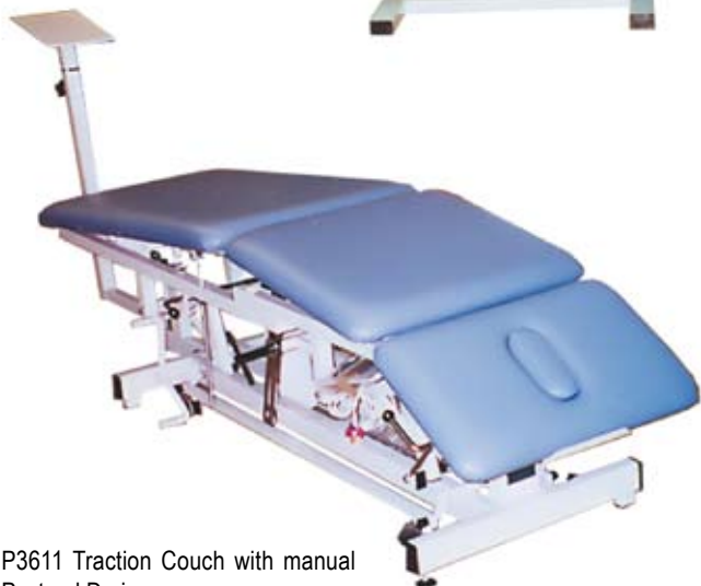
P3611 Traction Couch with manual Postural Drainage.