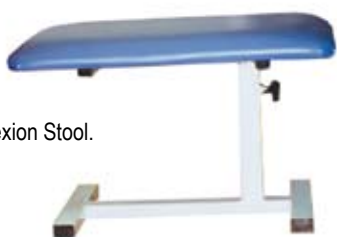
P370001 Flexion Stool.