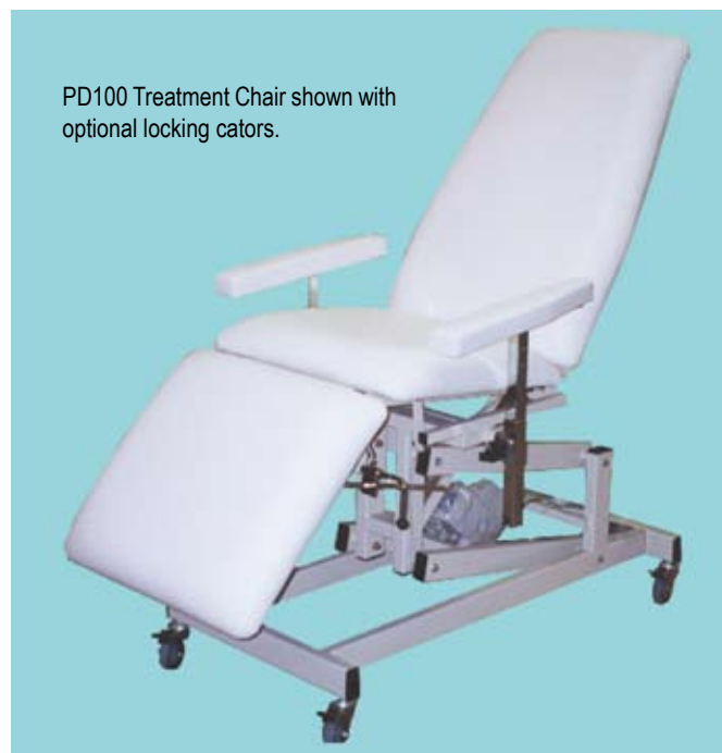
PD100 Treatment Chair shown with optional locking castors.