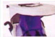
MPS Sun Shade