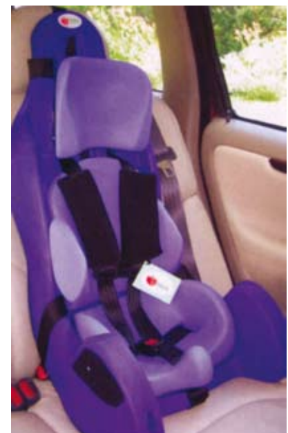
Special Tomato for the car.