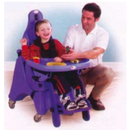
Multi-Positioning Seat with optional tray table.