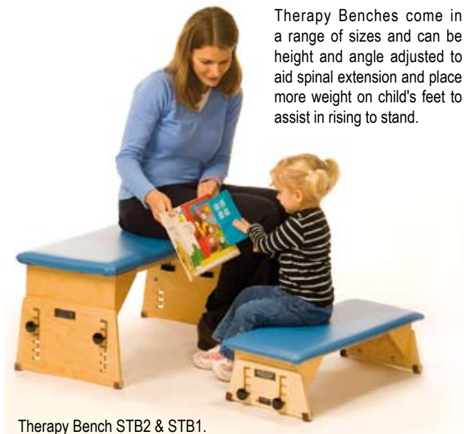
Therapy Bench STB2 & STB1.