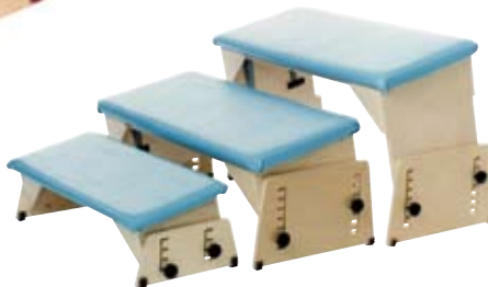
Therapy Bench STB1, STB2 & STB5.

This posture system, added to the Therapy Benches, can be combined in various ways to provide additional stability in sitting. The three part pelvic support adjusts the seat depth so that the length of the thigh can be supported on the seat surface. The adjustable height of the posterior support maintains the pelvis in a vertical position. Adjustable lateral pelvic supports minimize asymmetry in weight bearing and deviation from the midline. The femoral stabilizer with abductor, combined with pelvic support, prevents posterior tilting of the pelvis as well as rotation or obliquity of the pelvis. This component also stabilizes the hips and thighs in neutral alignment. The components of this seating system can be combined to cater for a child's individual needs.