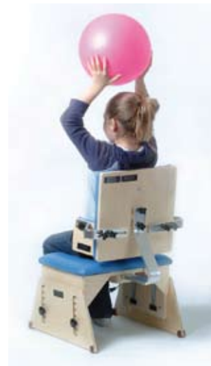
Posture System STB2-A0 shown on STB2 Therapy Bench, adds firm control for the pelvis and femurs.