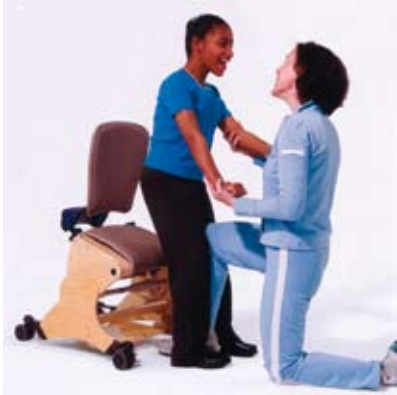
The Advancement Chair can provide forward tilting, with footboard pushed back, encouraging sit-to-stand practice.