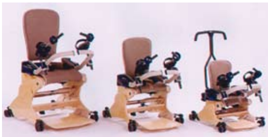
The Rifton Advancement Chair comes in three sizes. Push handle on small chair only.