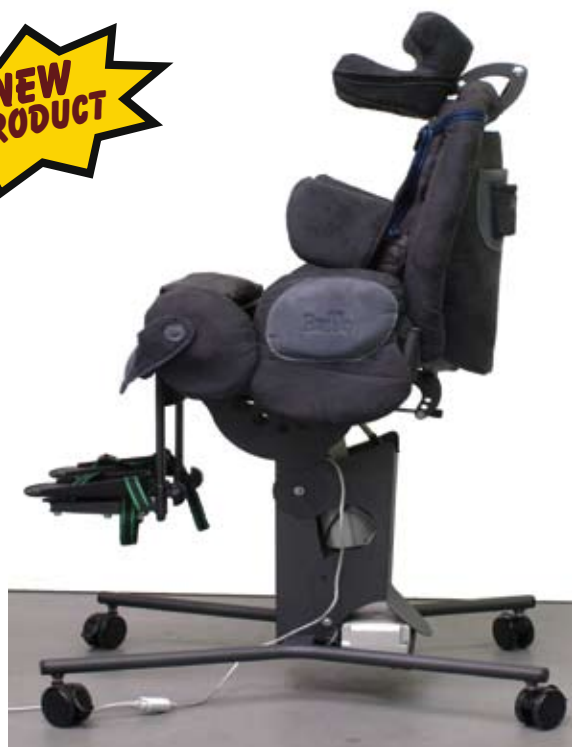
The Baffin with a power base and designer fabric, shown in sitting and lie-flat.