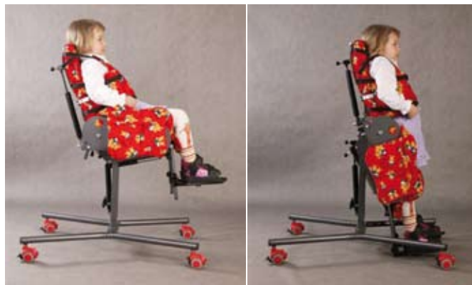
The Baffin Standing Seat changes position from sitting, standing to lying (below) thus preventing contracture of muscles