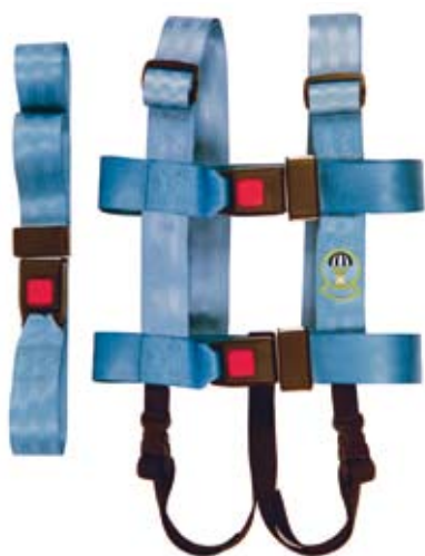
E-Z-ON Modified Vest comprises a vest with crotch straps and a leg belt.