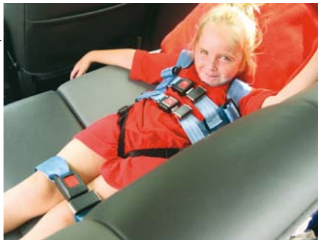
E-Z-ON Modified Vest helps to secure the child lying on the back seat of a vehicle.

The E-Z-ON Modified Vest allows a child to travel in a prone or supine position securely. This will suit certain disabilities such as a spinal injury or hip spica that requires the child to lie down during transport. The child can nap in the car. There is no need for modification/locking clips to be installed. Just put on the vest, lie the child on the seat, and secure the existing seat belts after threading them through the sides of the vest and the leg belt.