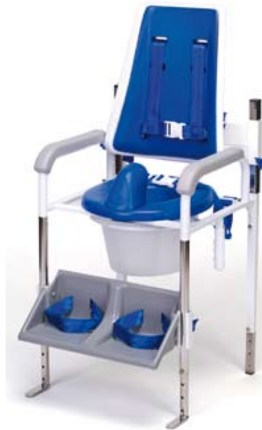
TPC5800 Medium Hi-back Commode