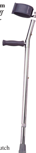
Forearm Crutch W10075