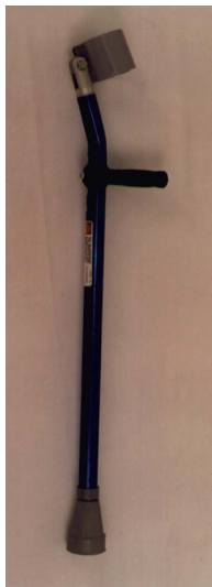
Royal Blue Forearm Crutches