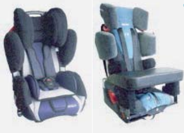
Young Sport Start Plus

Five sizes and different bases you can choose from.